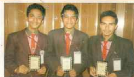
Winners of ITS Quiz-Whizz Competition (Preliminary Round)